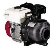
Poly Pump w/Honda Powered Gas Engines