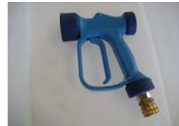
Heavy Duty Spray Gun