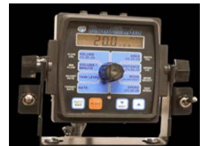
MicroTrac Sprayer Controls