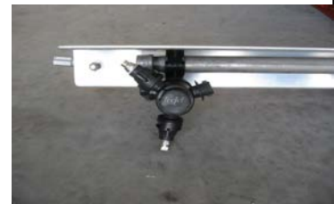
Turret Nozzle Bodies