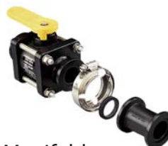
Poly Manifold Style Fittings