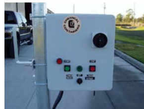
Bulk Pre-Treat Spray Systems