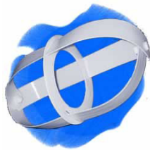
Tank Baffle Kits