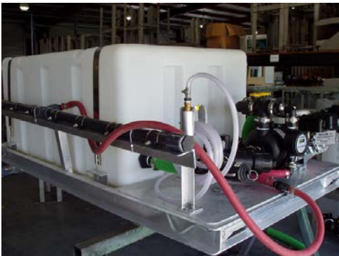
Econo 300LP Low Profile