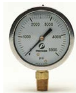
Stainless Pressure Gauge